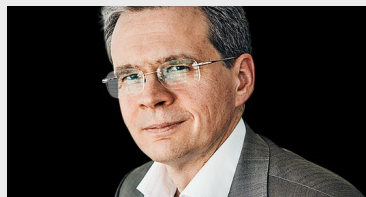
3 | → Zeno Staub CEO Vontobel 8|9|8|8|33